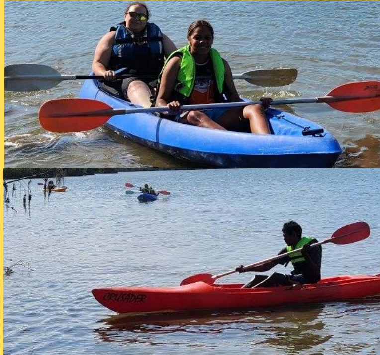
Kayaking for the first time