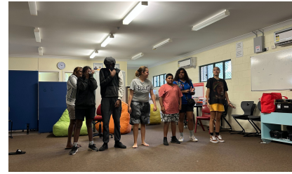
Back on Track Play

Back on Track play and residency tour, JUTE Theatre Company fearlessly tackles the pressing issue of road safety with an innovative and thought-provoking approach. Through a compelling blend of powerful storytelling, dynamic performances, and immersive theatrical techniques, our Dare to Dream Team bring the importance of responsible behaviour in traffic.